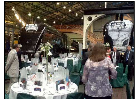
LNER Carriage Group