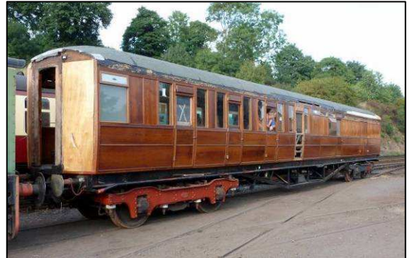
Right: 70759 emerges into the late sunshine

New Water Tank: We also now have the new stainless steel water tank for the supply to 70759's WC.