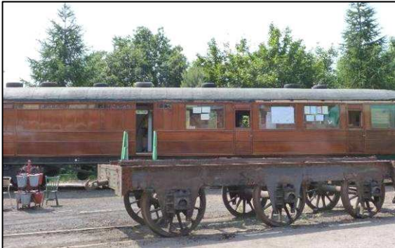
Left: complete with its 'pneumatic air-conditioning pods';

The eighteenth of July 2013 is a significant date in 70759's progress towards its completion and operation as the main brake in the SVR's Teak Train. The covers protecting the old roof were removed revealing this emerging butterfly uncluttered by ropes, old tyres and sheeting – but confirming the need for the new roof. On one of the hottest days of 2013, amid a major shunt of the restricted Bewdley Yard, the carriage has now found its way into the Bewdley Carriage & Wagon Works for the costly renewal of the roof timbers. It will then be watertight and weatherproof.