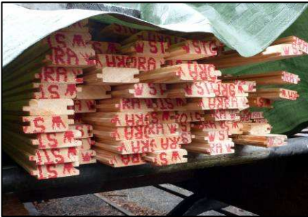
All this wood (and quite a bit more)

A huge amount of work has been done since Newsletter 31, and the following pictures aim to give readers an idea of some of the progress.