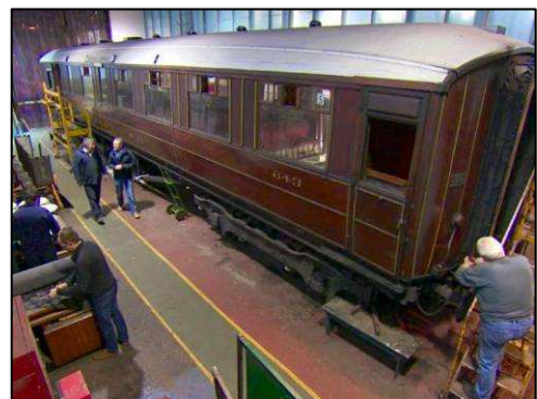
LNER Buffet Car 643 in the Paintshop during its overhaul