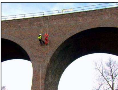
Abseiling down the side of the viaduct

These pictures, give a flavour of the SVR item, which started with archive pictures of Bewdley Station and moved to the £0.5m repairs to Falling Sands Viaduct between Bewdley and Kidderminster carried out in the Railway's post-Christmas 'closed' season.