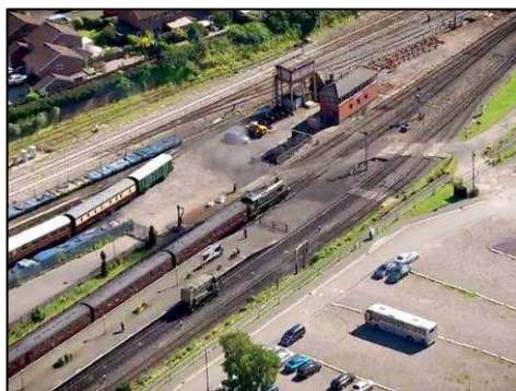
A magnificent 'Hornby-Dublo' view of Kidderminster Station from the air