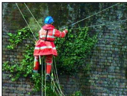
Removing the damaging vegetation