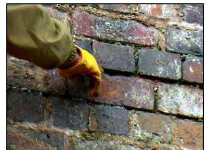
Close-up showing the pointing work needed