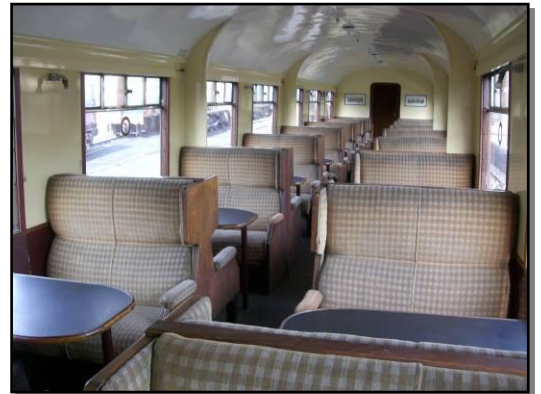
Pictures 1, 2 and 3, with some of the 43600 workers & the carriage in the LNER train at Arley (Bob Sweet)