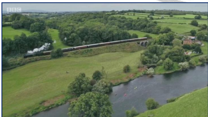
LNCR Carriage Group

There were a few brief shots of the whole train. Here are two stills from the transmission. The first is a drone view taken between Highley and Arley, and the second shows the stationary train at Kidderminster Town, where the station is making a brave effort to replicate Doncaster. Happy New Year!